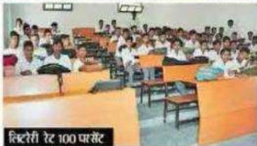
लिटरेरी रेट 100 परसेंट